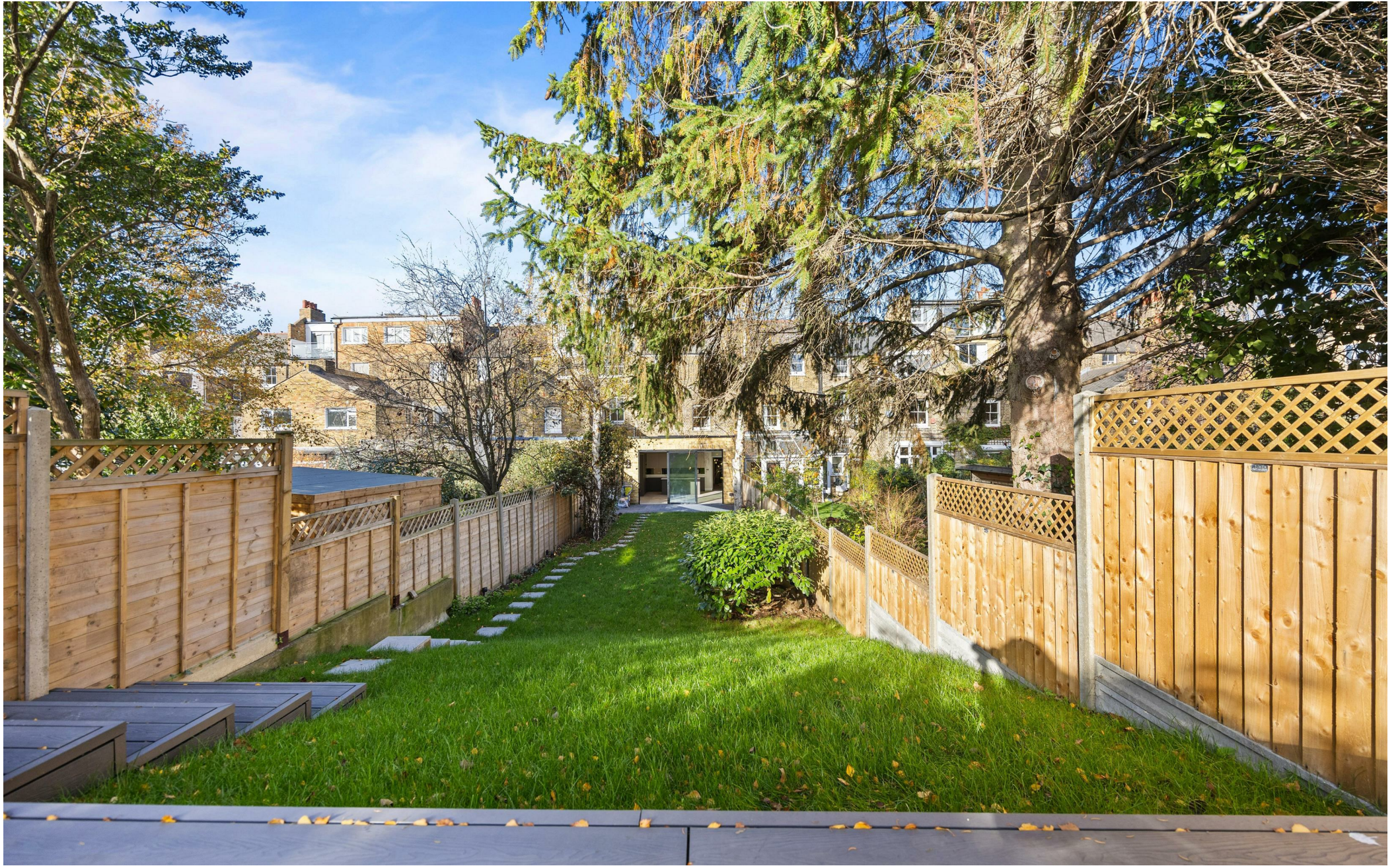
Gondar Gardens NW6